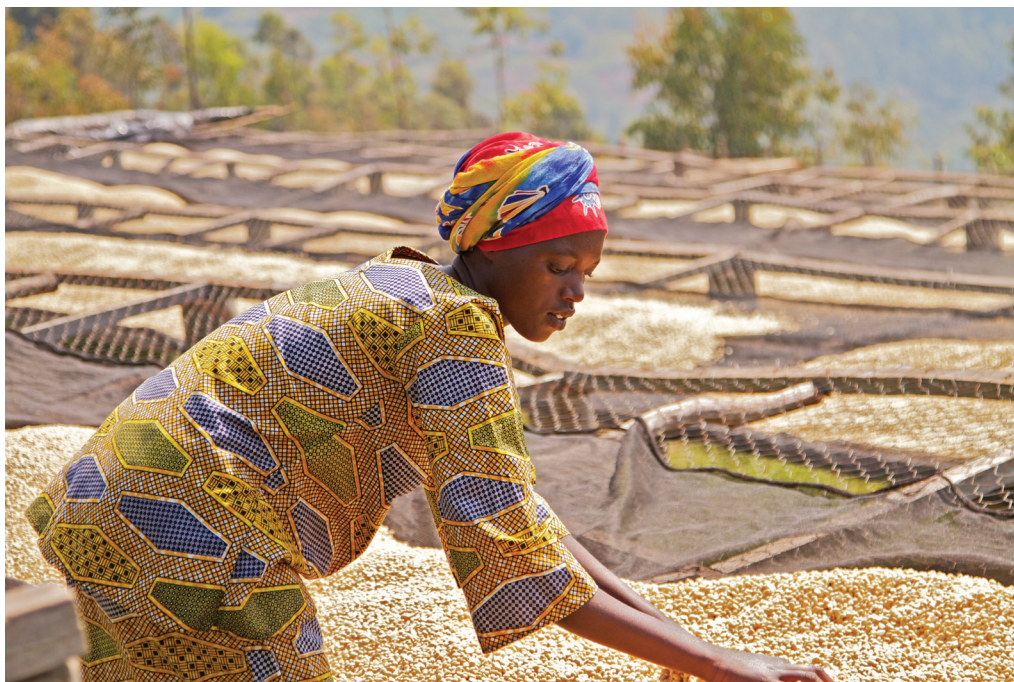
A woman at the Dukundekawa cooperative in Musasa, Rwanda, prepares coffee beans for drying.