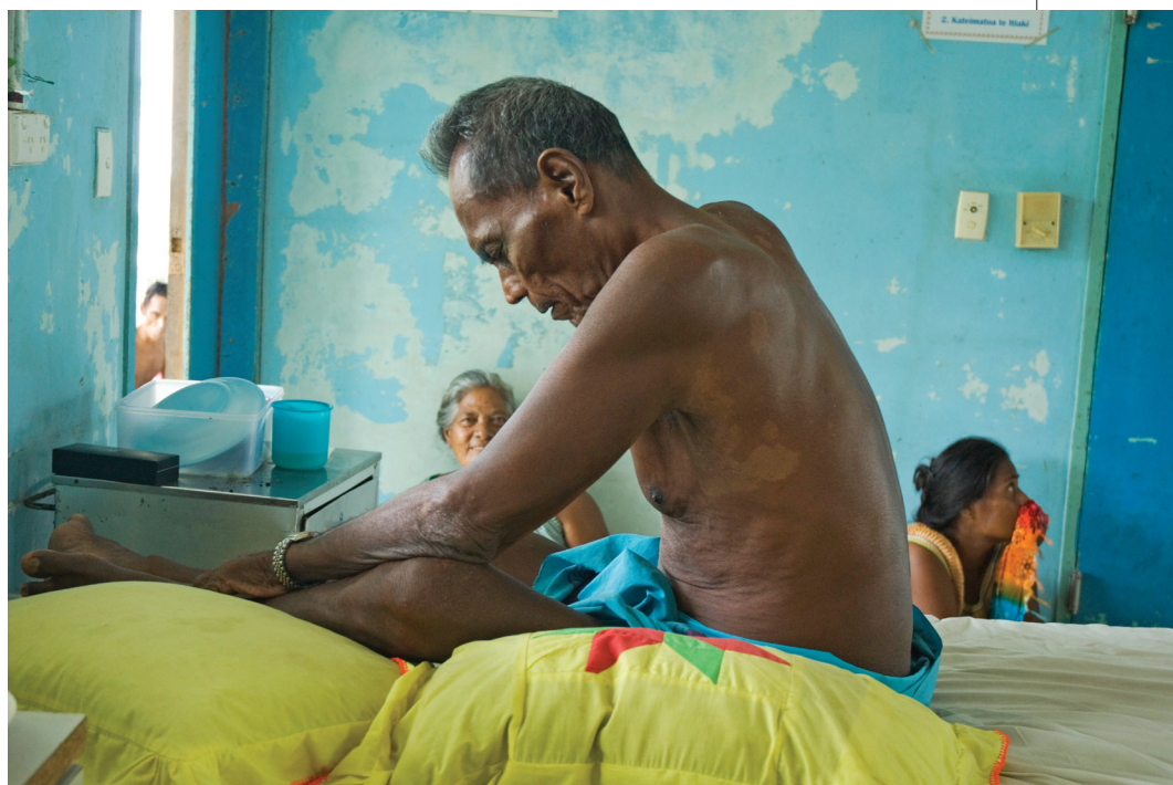
A man is examined for tuberculosis at the Kiribati Hospital in the island nation of the Republic of Kiribati.

Anacor would welcome the implicit validation that would come with a Gates Foundation partnership, which would allow it to develop its technology platform