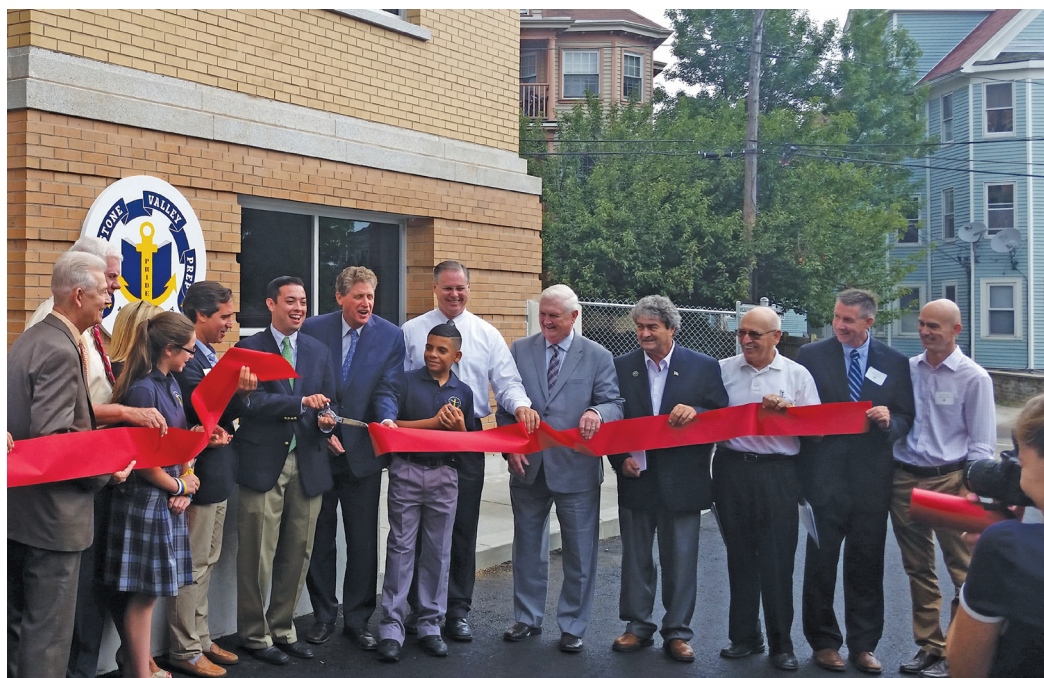
School officials celebrate the opening of Blackstone Valley Prep middle school, in Central Falls, R.I.