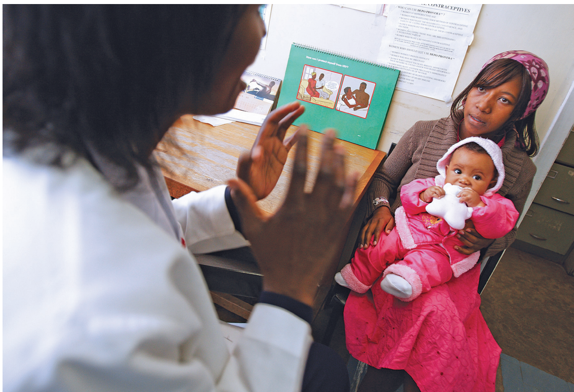
A mother and her six-month-old daughter meet with a nurse to learn more about family planning.