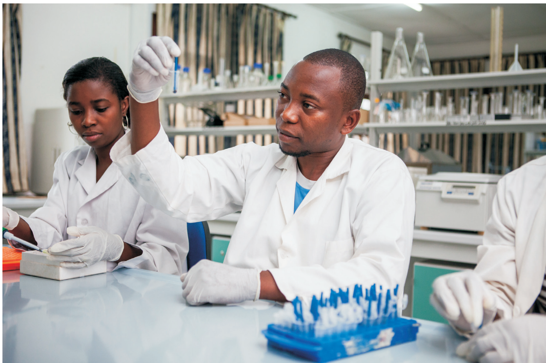
Lab technicians at the Ikafara Health Institute in Tanzania prepare mosquito samples for DNA extraction.

The Kymab malaria project has generated data pointing to vaccine components that could be used in humans to provoke antimalarial responses. The project has gone