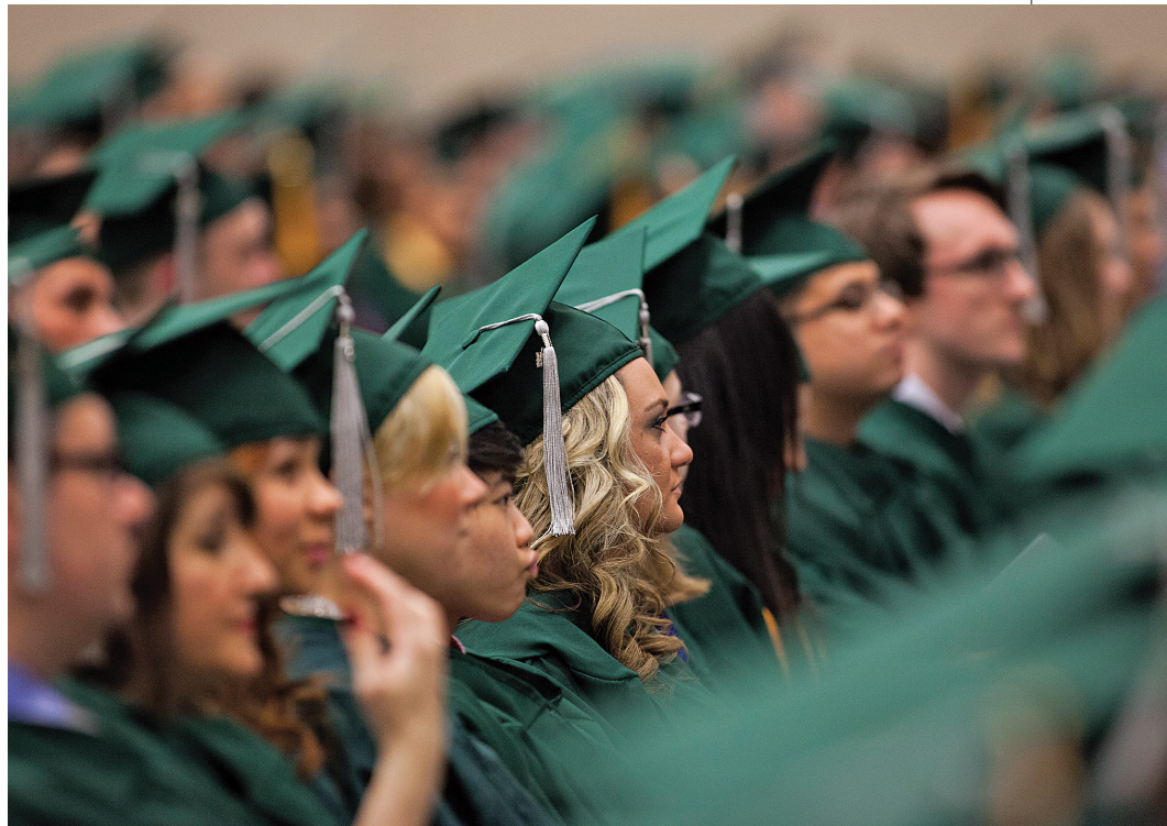
The College of DuPage, a community college in Glen Ellyn, Ill., held its graduation ceremony in 2014.